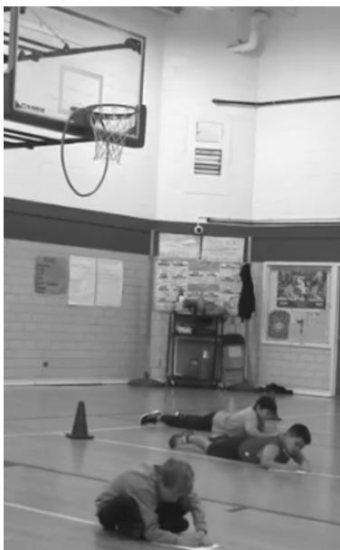
PHE In Action