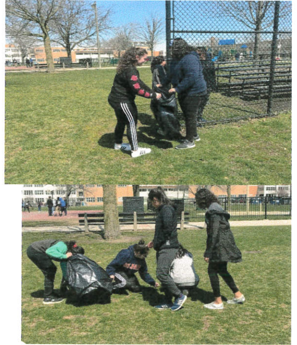
Sciences – Gr. 4-8 Caring for the Environment